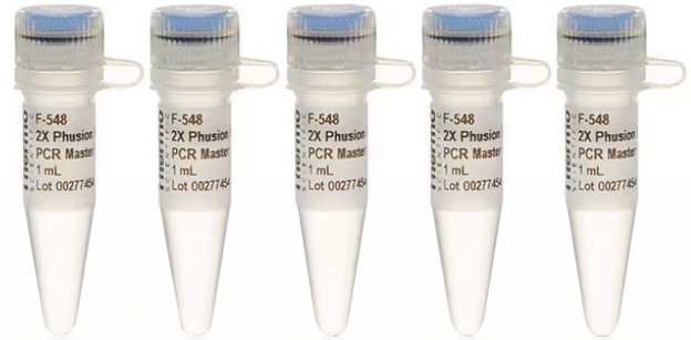
F548L Phusion Flash High-Fidelity PCR Master Mix