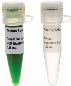
K1081 DreamTaq™ Green PCR Master Mix (2X)